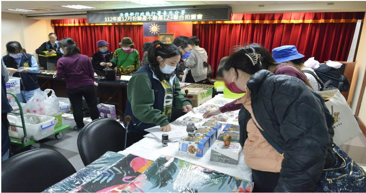
Over a thousand pieces of jewelry auctioned by the Taipei Branch